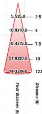
Footcandles with 500w FDF Lamp

The luminaire shall be supplied with a color frame and a rigid strap yoke. Optional mounting clamps, trunnions and canopies with mounting hardware shall be available. A three foot three wire lead encased in a black fiber-glass sleeve is standard. The fixture shall be also be available as a two and three cell unit with a common or independent power cord(s). All painted surfaces shall be baked enamel.